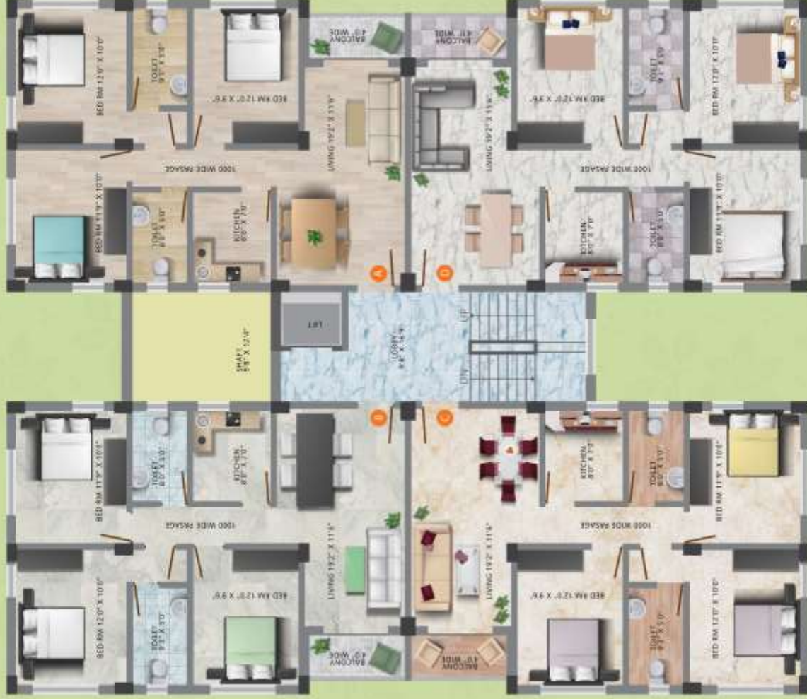
Typical Floor Plan Block-1