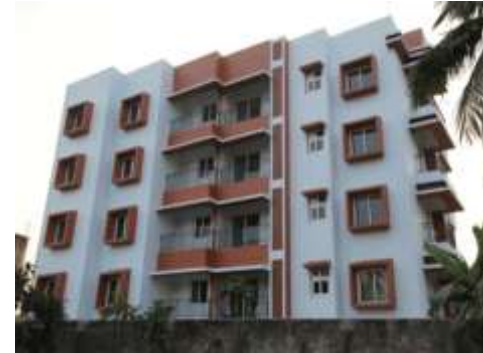
Atri Bliss - Kolkata