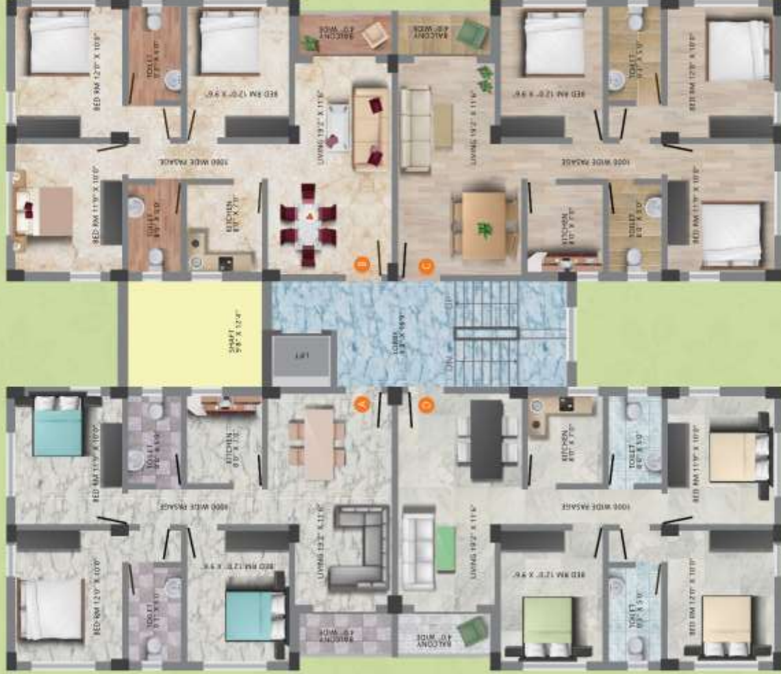
Typical Floor Plan Block-2