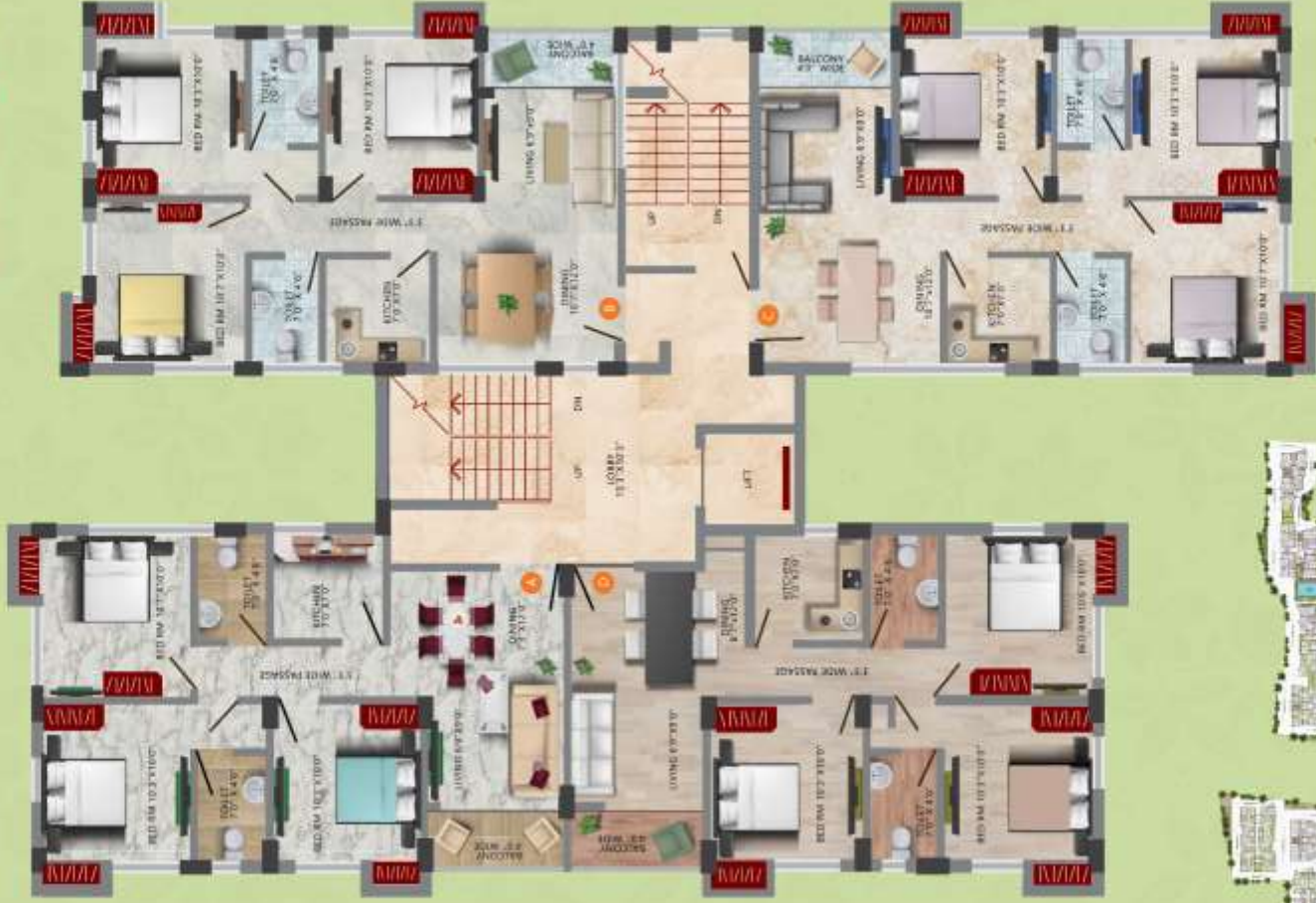
Typical Floor Plan Block-11