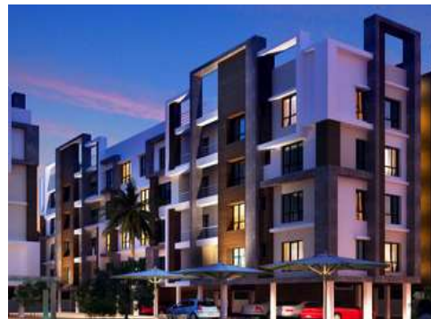
Atri Green Residency - Kolkata