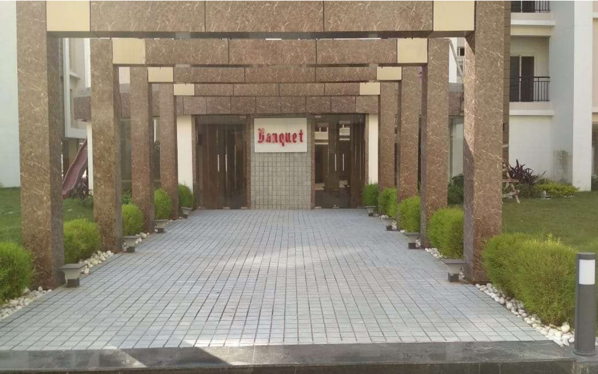
AC Banquet Hall