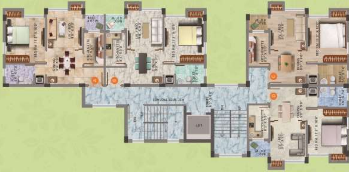
Typical Floor Plan Block-9