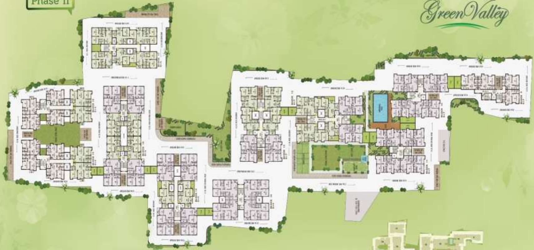
ATRI GREEN VALLEY PHASE-II