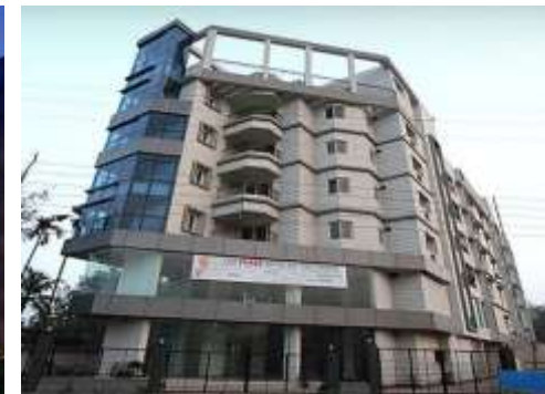
Atri Green View - Kolkata