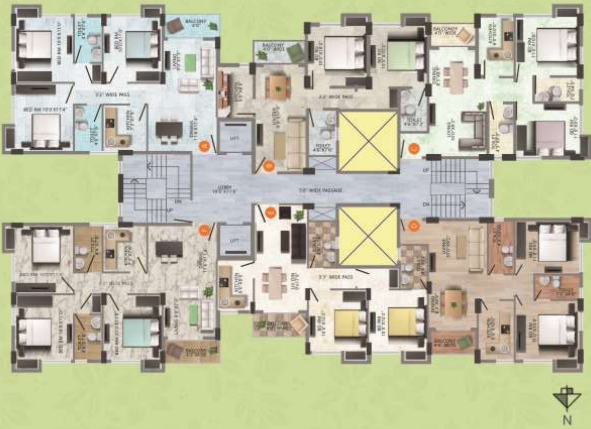
Typical Floor Plan Block-13