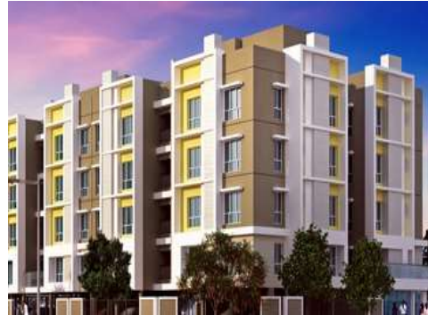
Atri Green Enclave - Kolkata