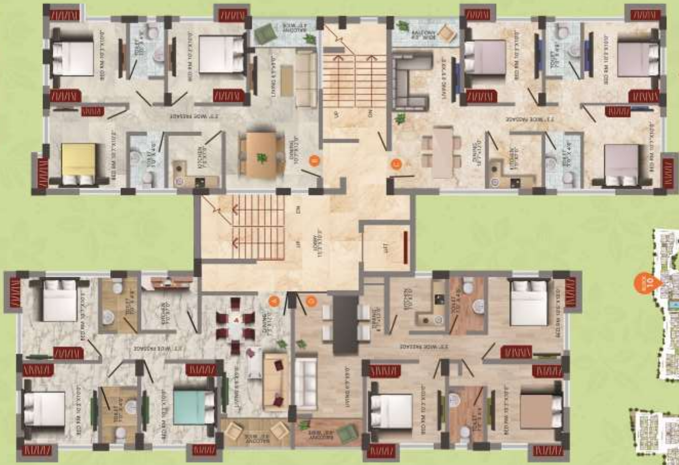
Typical Floor Plan Block-10