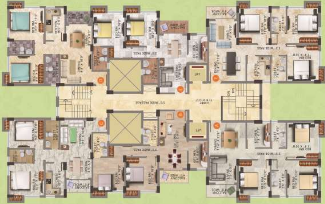
Typical Floor Plan Block-12