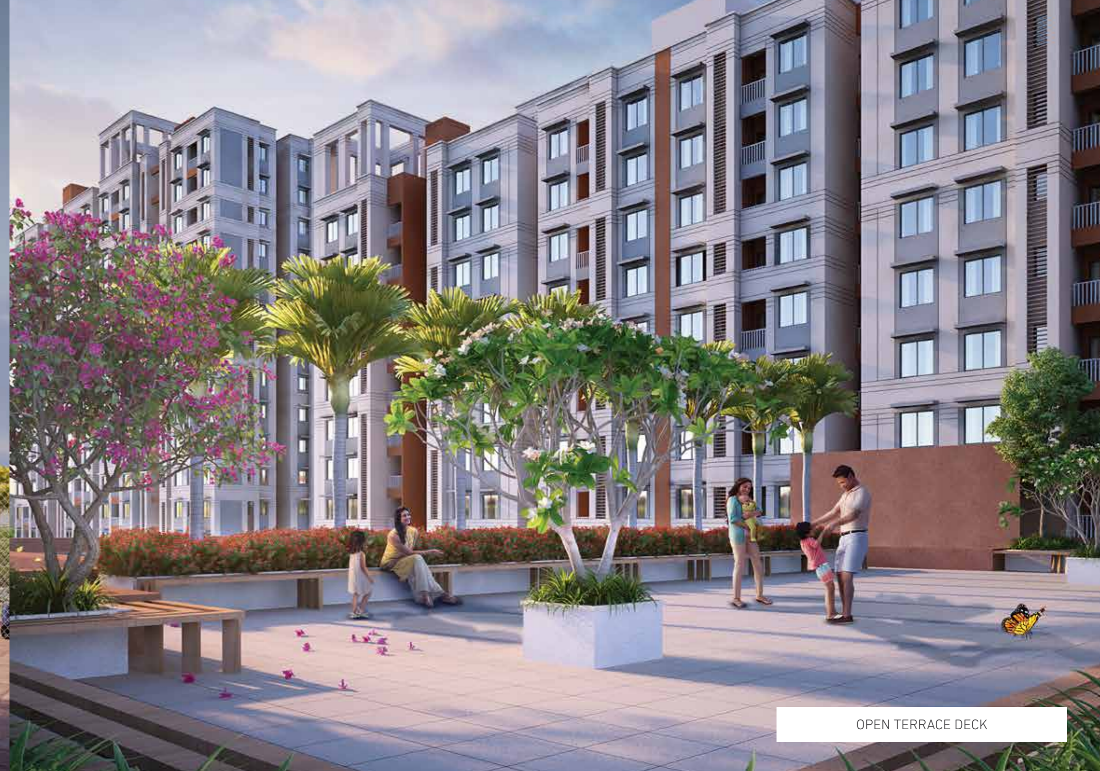
OPEN TERRACE DECK