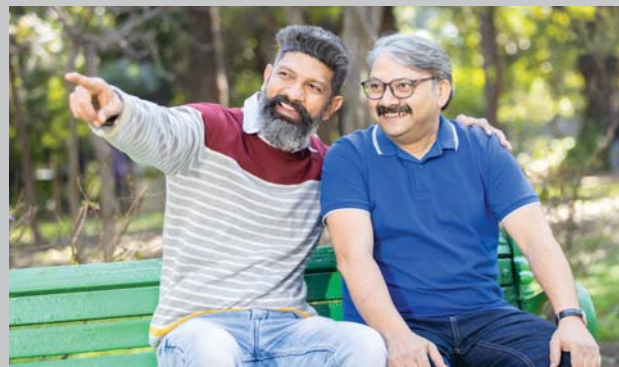
Senior Citizen's Zone