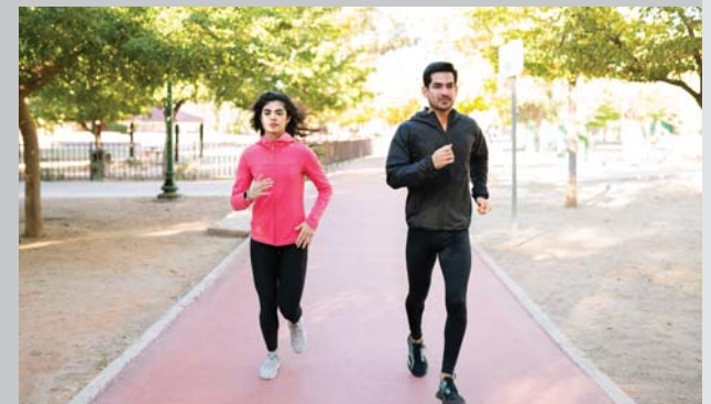
Jogging and Walking Space