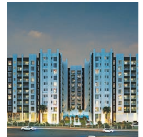
Cloud 9, Kolkata