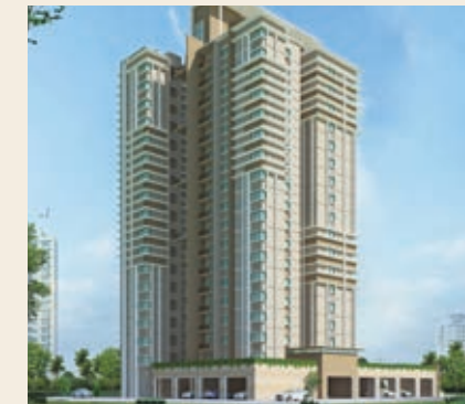
Luxuria Heights, Kolkata