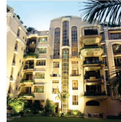
Heritage Mayfair, Kolkata