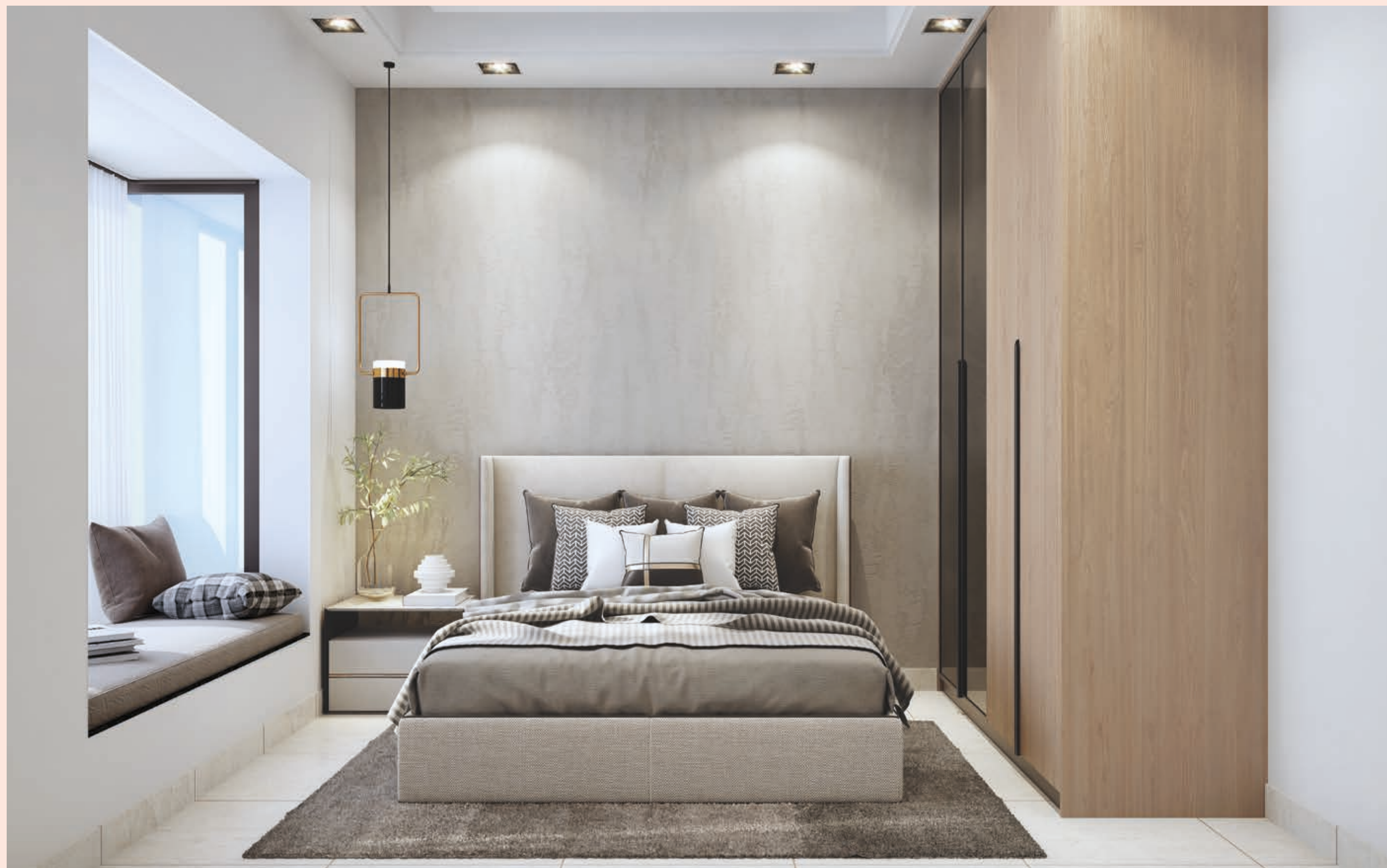
Bedroom with bay window