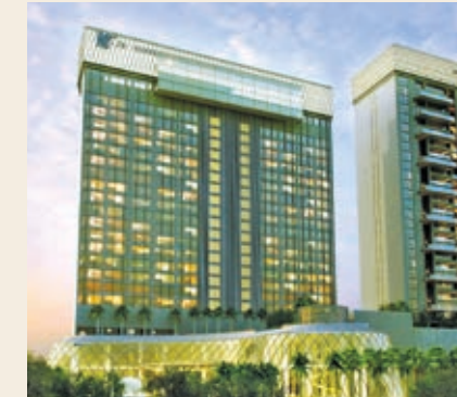
JW Marriott, Kolkata