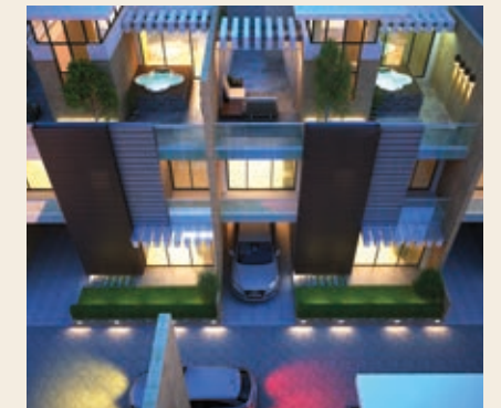
Silveroak Estate Prive, Kolkata