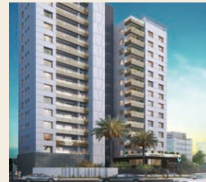
The Avenue, Kolkata