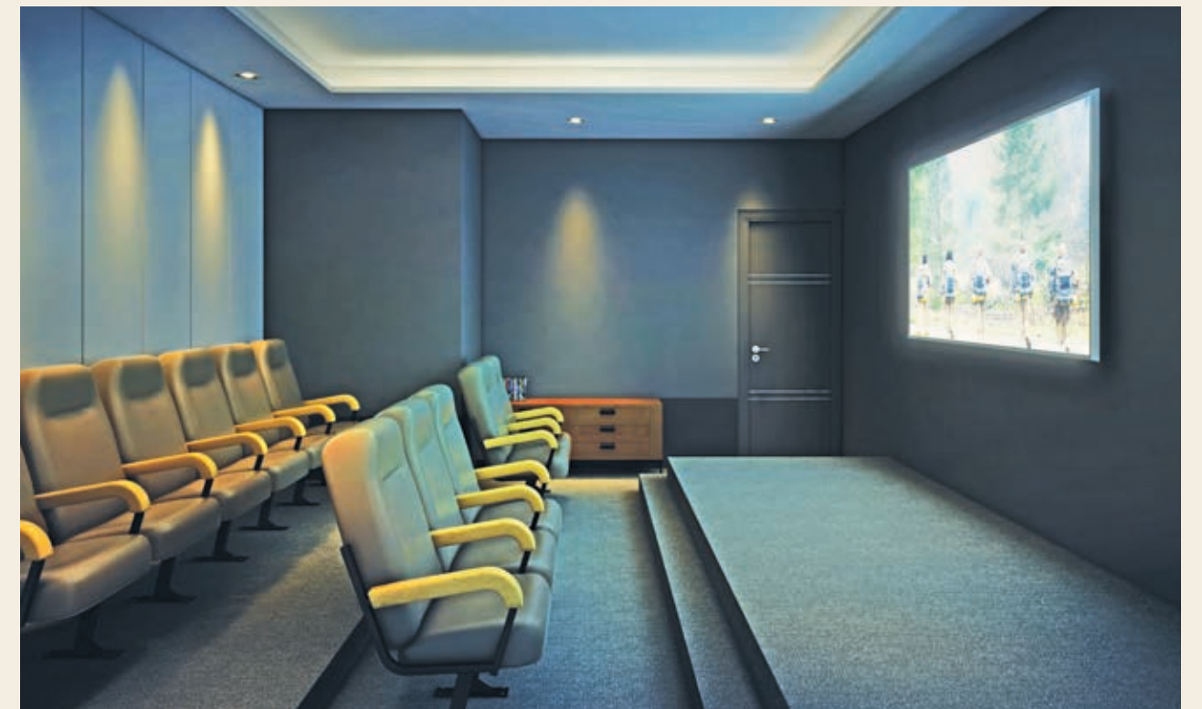
Mini Theatre Room