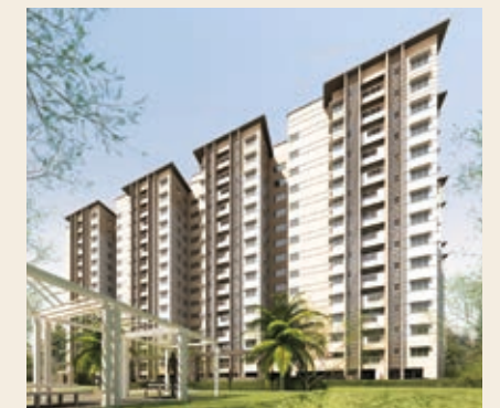
Necklace Pride, Hyderabad