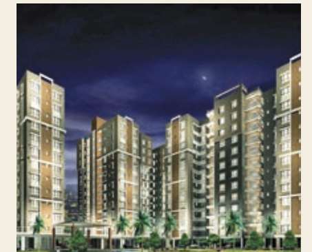
Salarpuria Gardenia, Durgapur