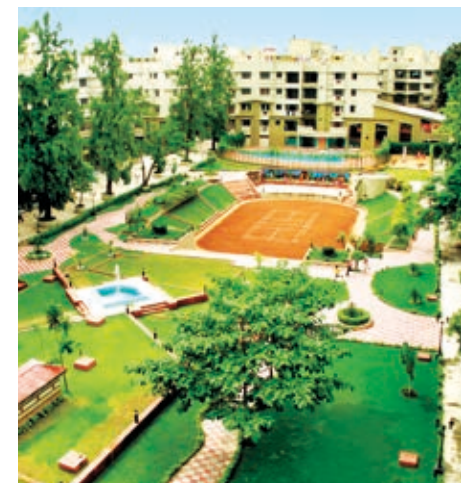
Sherwood Estate, Kolkata