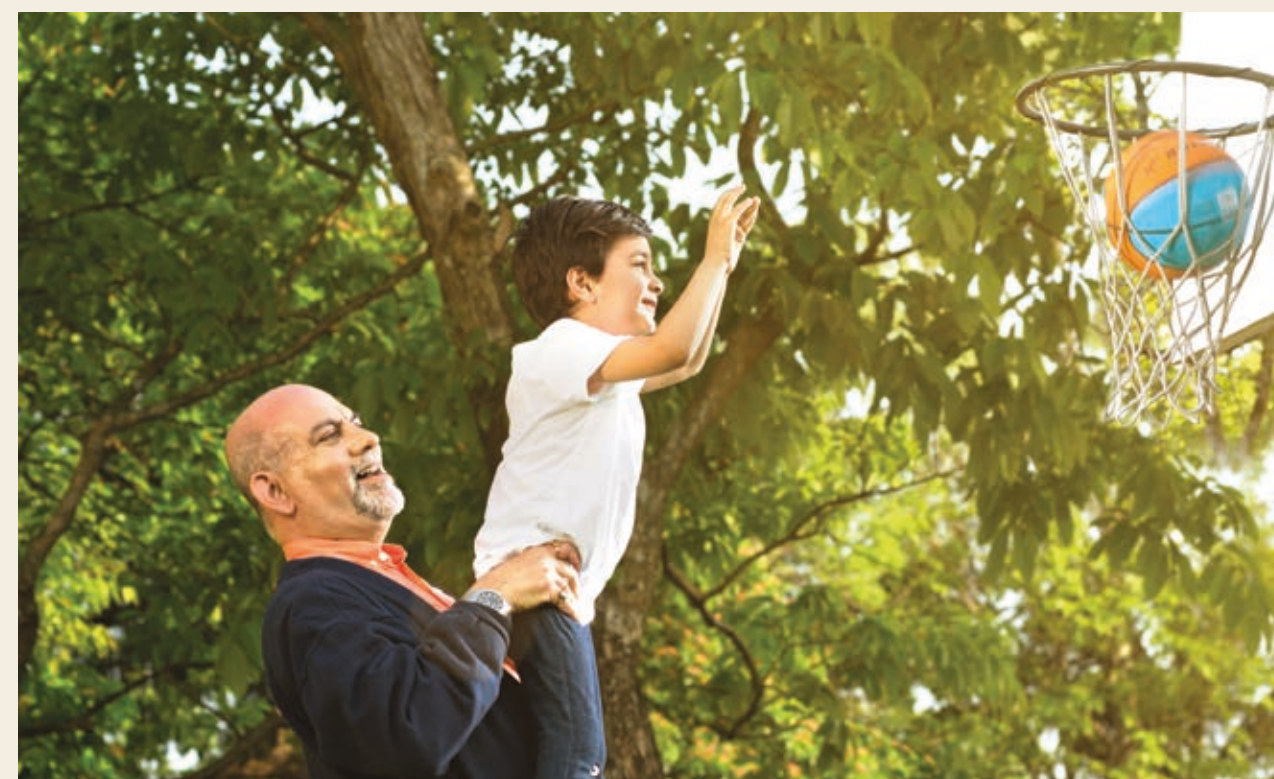
Half Basketball Court