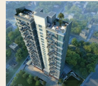
Victoria Vistas, Kolkata