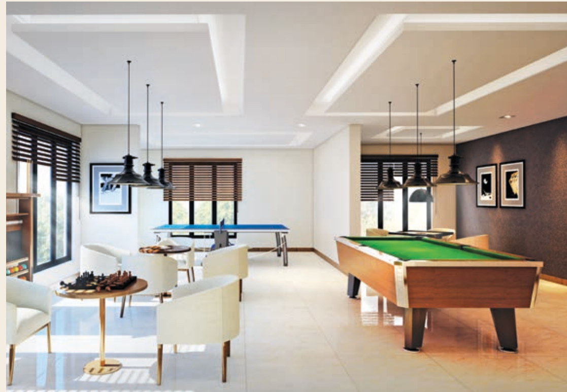
Indoor Games Room