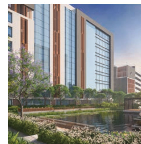
Intellia Business Park, Kolkata