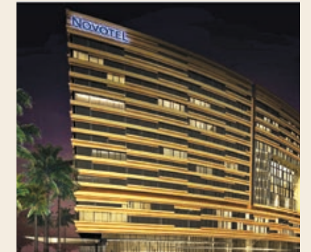
Novotel Hotel & Residences, Kolkata