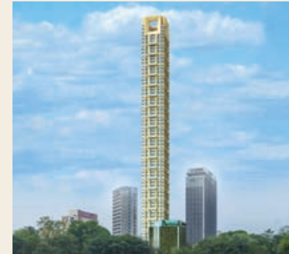
The 42, Kolkata

A SALARPURIA GROUP & SIGNUM GROUP DEVELOPMENT