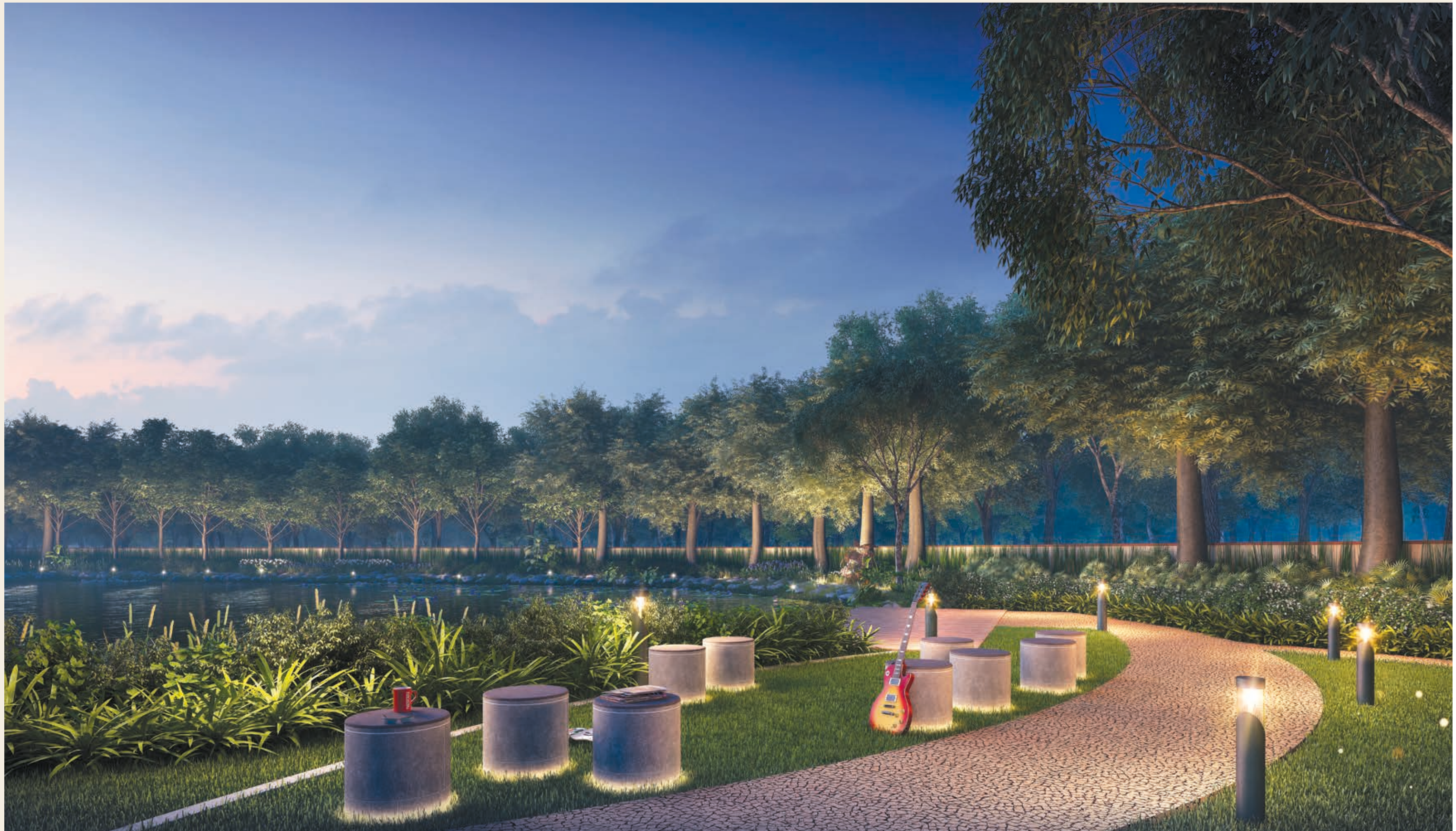
Adda Zone Laugh your heart out. Call your friends and share the memories of your sun-kissed life.